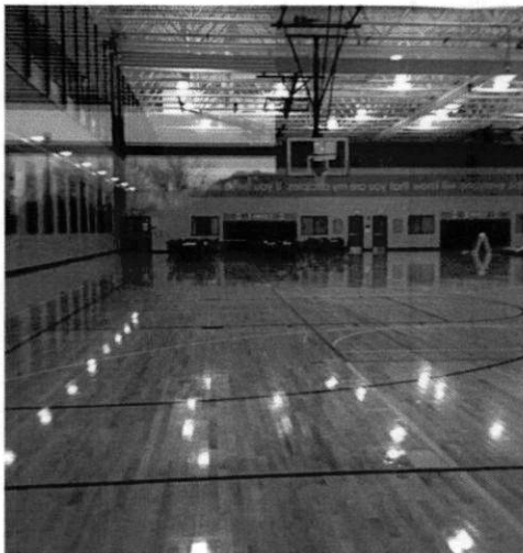
Living Hope Baptist Church Recreational Center