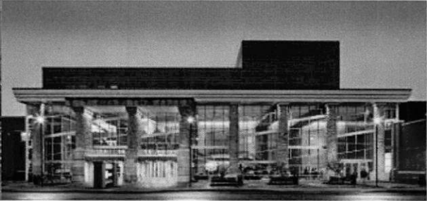
Southern Kentucky Performing Arts Center (SKyPAC)