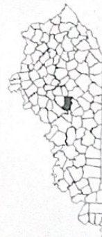
Location of Marion County in Kentucky